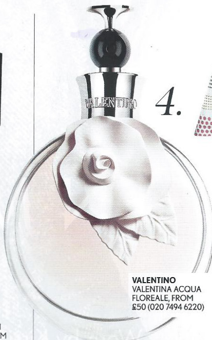
VALENTINO VALENTINA ACQUA FLOREALE, FROM £50 (020 7494 6220)