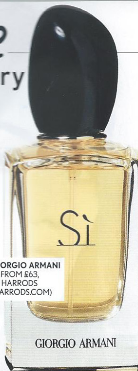
GIORGIO ARMANI SI, FROM £63, AT HARRODS (HARRODS.COM)