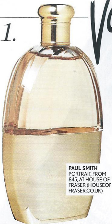
PAUL SMITH PORTRAIT, FROM £45, AT HOUSE OF FRASER (HOUSEOF FRASER.CO.UK)